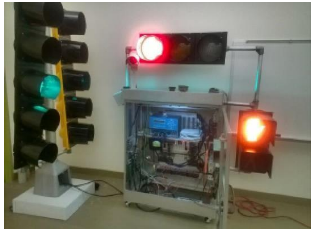
Fig: Fall, 2017 Open House at SIUE School of Engineering