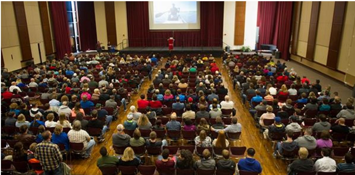
Fig: SIUE School of Engineering Annual Banquet