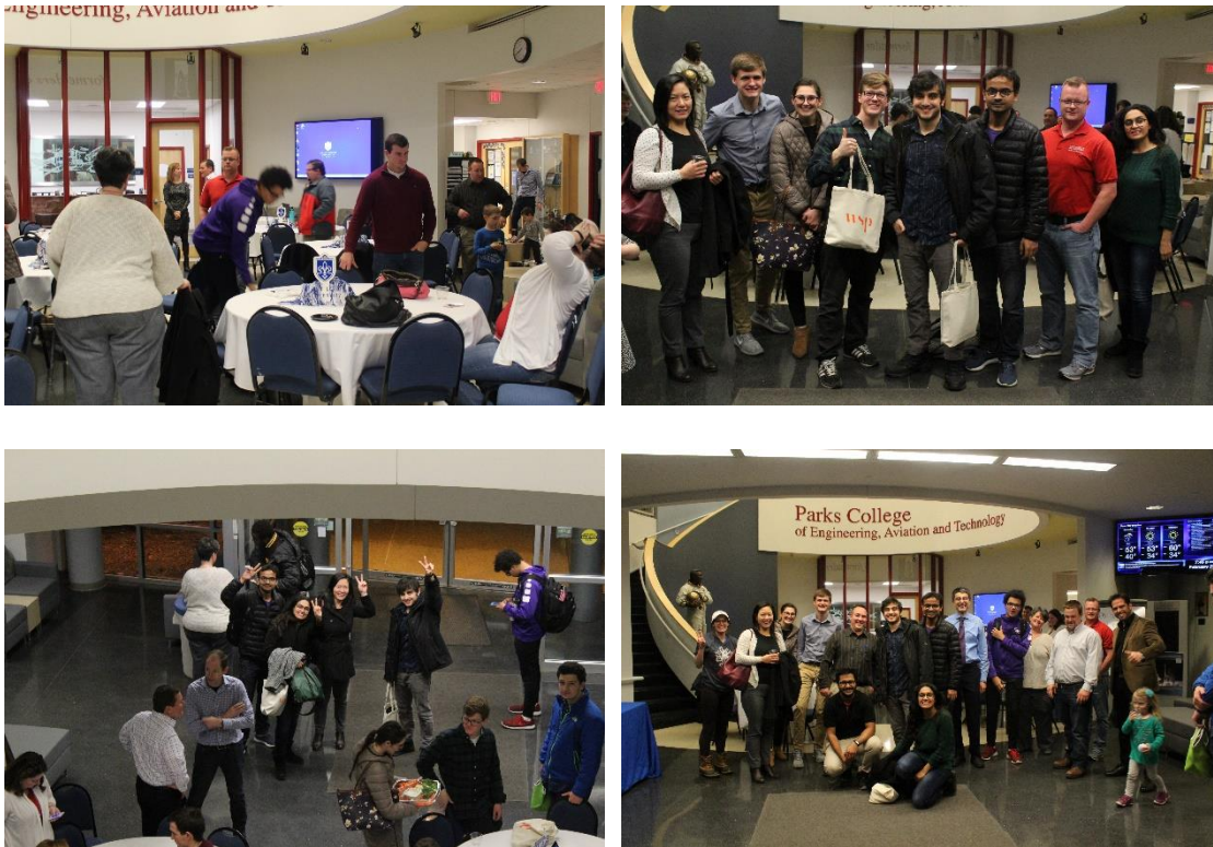
Fig: 5 th Annual St. Louis Collegiate Traffic Bowl Scrimmage and Networking Event

The chapter students have attended the 5 th Annual St. Louis Collegiate Traffic Bowl Scrimmage and Networking Event organized by TEAM STL (Transportation Engineers' Association of Metropolitan St. Louis) at St. Louis University. This was a family friendly event for civil engineering professions and students. A number of students from Washington University in St. Louis, University of Missouri, St. Louis, St. Louis University and Southern Illinois University Edwardsville (SIUE) has attended the traffic bowl. members from SIUE ITE Student chapter had shown great promise and won a number of prizes. It was a great event to network with other students and professions from the region.