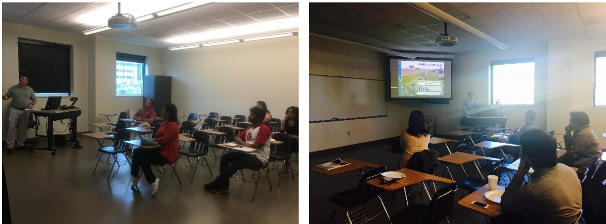
Fig: Student Chapter Meetings

Furthermore, the ITE Student Chapter, SIUE has plans to join the 2018 Midwestern District ITE Annual Conference and the 2018 Midwestern/Great Lakes Student Leadership Summit which will be held in Minneapolis, Minnesota during August.