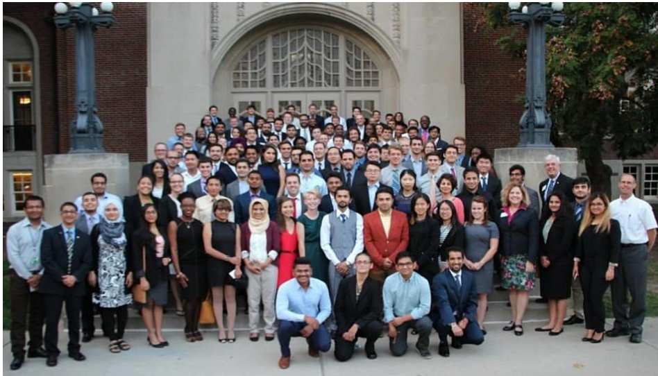
Fig: ITE Midwest/Great Lakes District Student Leadership Summit 2017 at Purdue University, Lyles School of Civil Engineering