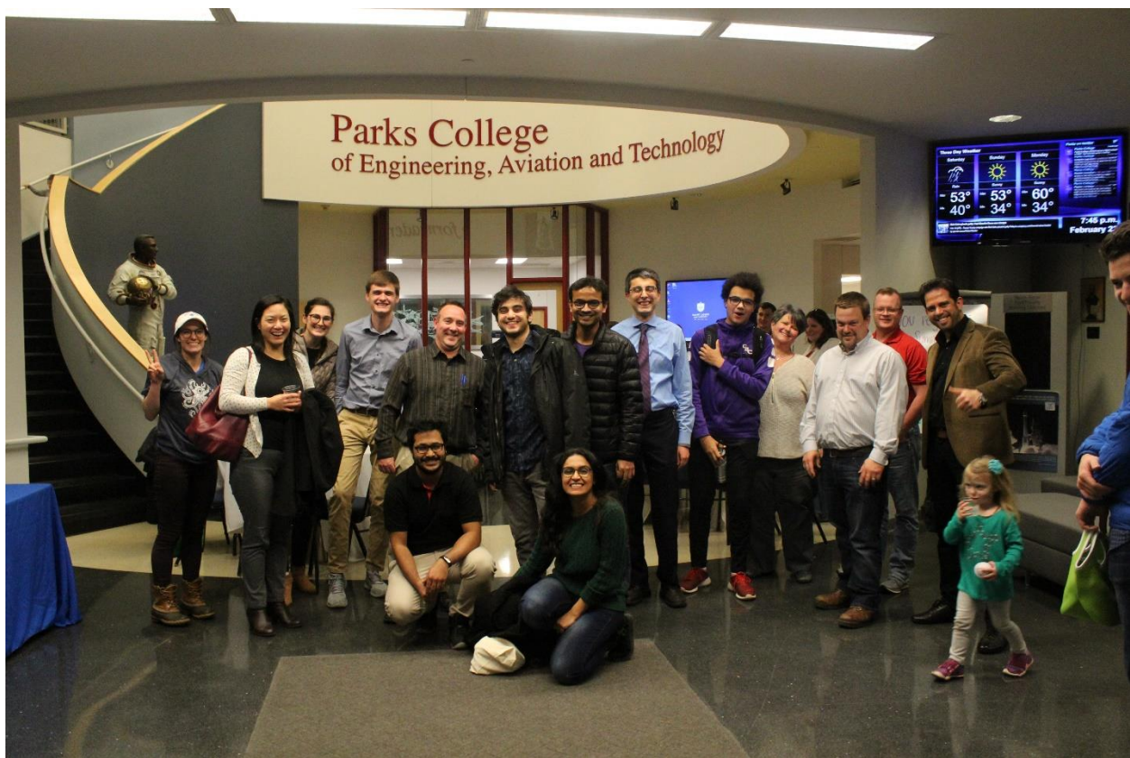
Fig: Members of the SIUE ITE Student Chapter at SLU Traffic Bowl

The SIUE ITE student chapter has been dedicated to connecting the students of transportation engineers in the area. The Southern Illinois University Edwardsville student chapter usually holds two to five meetings every semester. Engineers from the industrial field and state government together with professors from other universities are invited to give presentations on the planning, design, operation and maintenance of the transportation system. The meetings give students a chance to understand what jobs transportation engineers work on, while they are still in a learning environment. Both graduate and undergraduate students are members of the student chapter who get benefited from attending the professional meetings which give them the opportunity to networking with the industry leaders as well as professional engineers, academia etc.